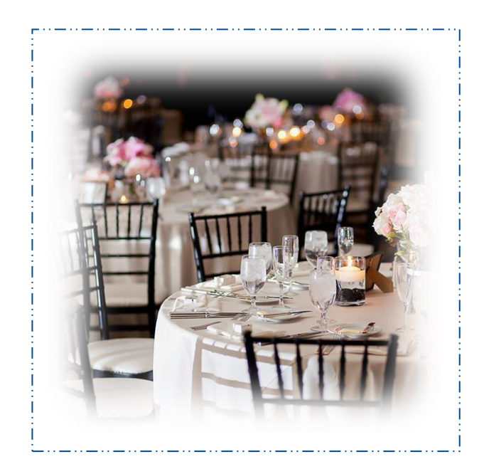
Banquet - Save the Date Friday, May 4 Location to be announced.

May 19-21. One of our biggest fundraisers of the year. Like Grapefest, we have the opportunity to use the Master Made parking lot and man an entry gate, so we need lots of parent and student volunteers \bigcirc